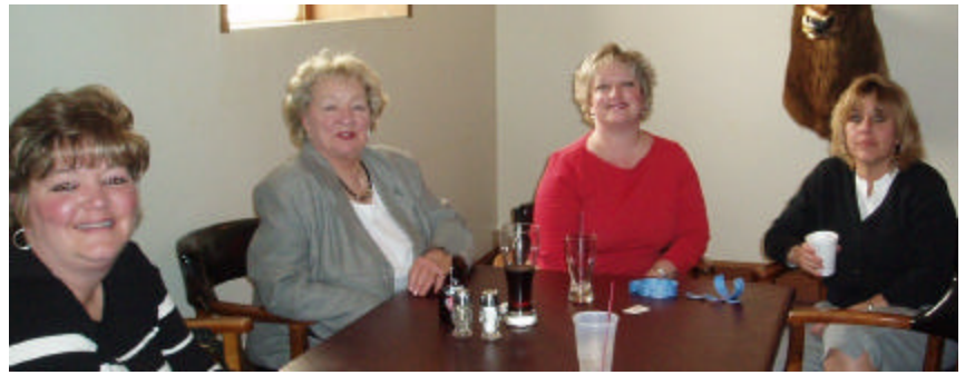
Thanks Moms, Dads, Grandmas, and Grandpas and friends for coming